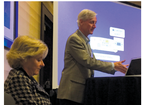
Photos from the SEA Meeting in Washington D.C. (From top left to bottom right):